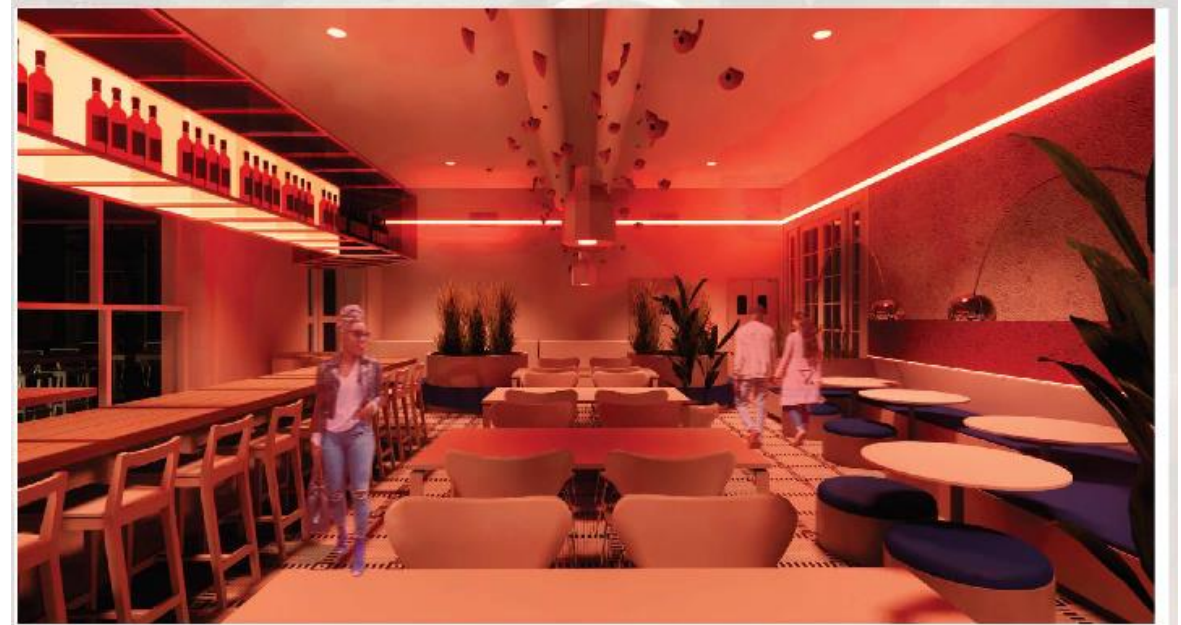
Mono Color at Dinner

Nafsi means Soul in Arabic, Swahili and other languages