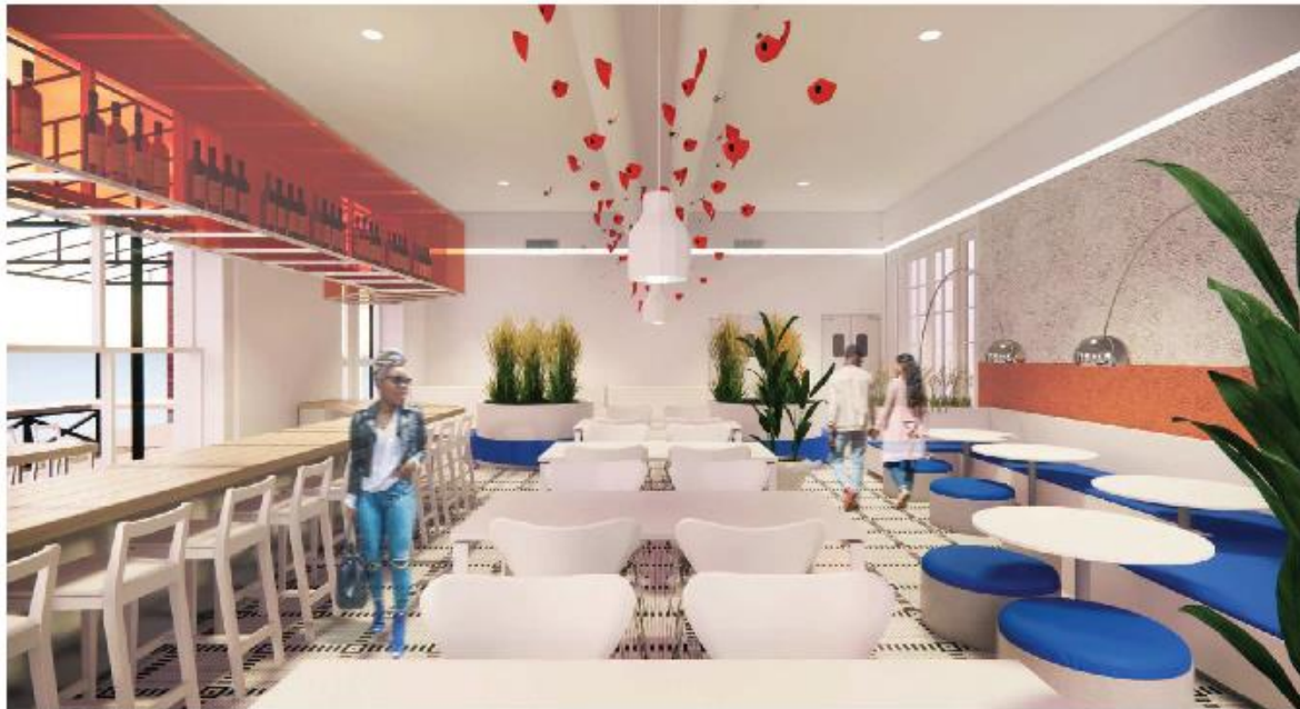
Dining Room by Day

10 yr contract to take over the former Parrot Cage Restaurant space $250,000 Grant Finalist Donnell Digby Woodlawn 1200 restaurant, FoodLab 1.0